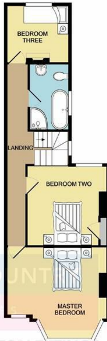
1ST FLOOR APPROX. FLOOR AREA 560 SQ.FT. (52.0 SQ.M.)